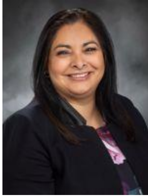
Senator Manka Dhingra, JD